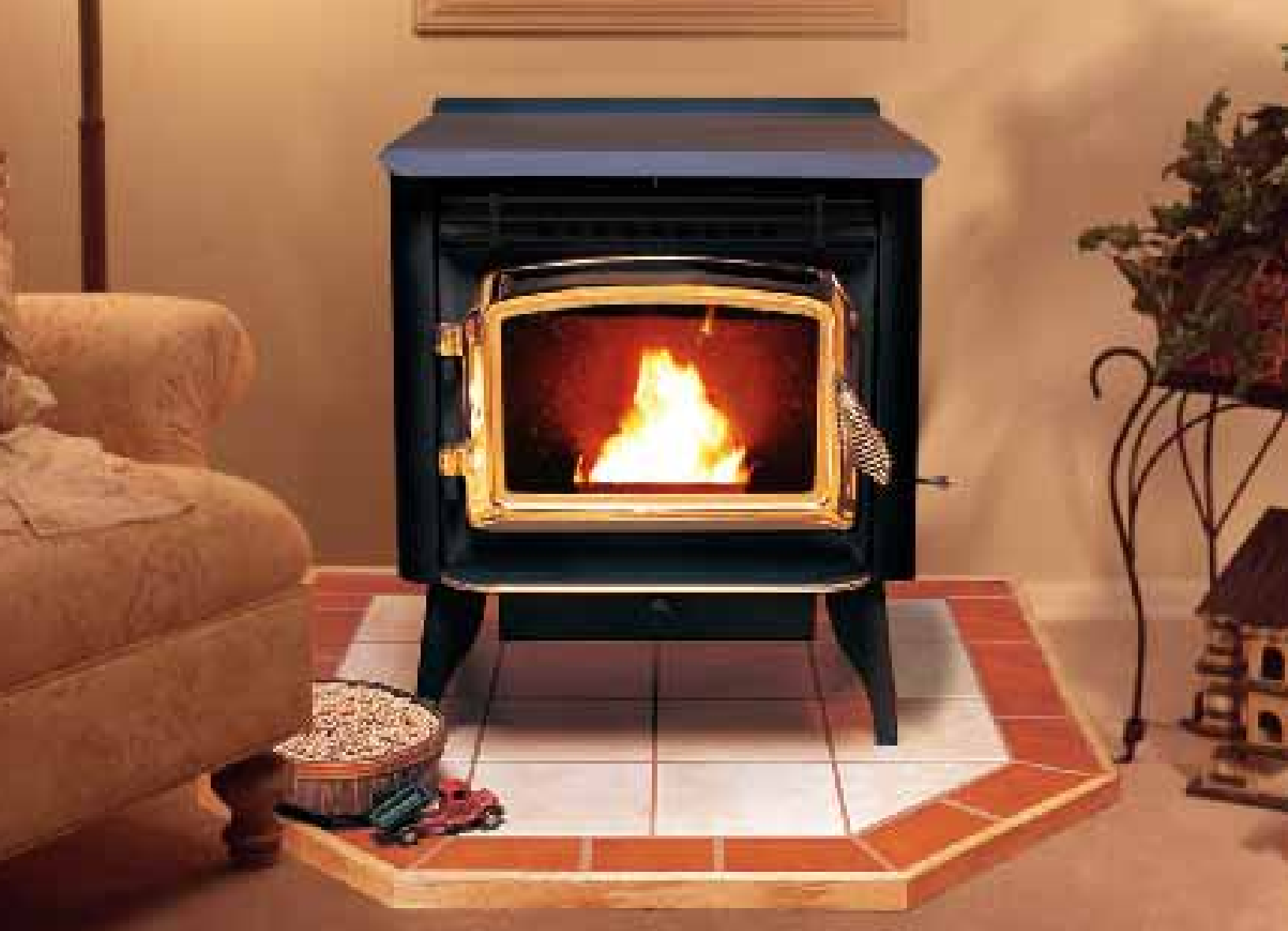
Cascade™ stove shown with optional gold door

■ There's a good reason why thousands of homeowners can't live without the warmth of their pellet stove. The fuel burns efficiently, the heat is dense and effective and the burn times are long. The affordable Cascade™ pellet stove is the ideal introduction to this beloved heating method. The patented UltraGrate™ achieves nearly 100% fuel efficiency, while the generous 60-lb. hopper and automatic feed system deliver up to 30,000 BTUs per hour and can operate up to 40 hours. It's a great value that is as sure to perform as the winter is cold. ■